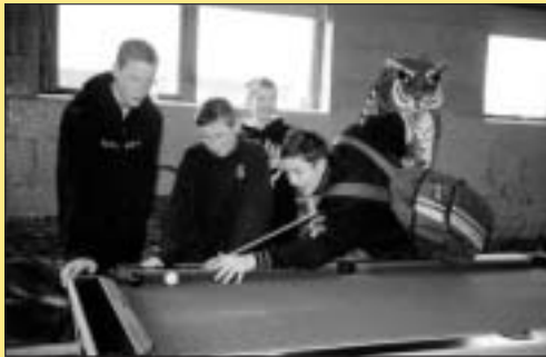
Playing pool in the waiting area at the Pop Inn

Staff at The Pop Inn offer a comprehensive package of support to young people in partnership with local schools (see below). The strong partnership between health and education has contributed to a significant drop in teenage pregnancy rates.