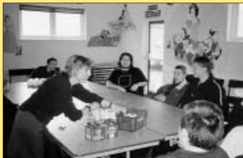
School nurse leading a boys' session at the Pop Inn

youth worker, a school nurse and a receptionist. A smoking cessation advisor and a drugs advisor complete the team. Ongoing evaluation has enabled the service to develop further in meeting the needs of the young people.